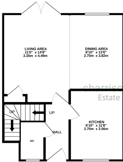
GROUND FLOOR 472 sq.ft. (43.8 sq.m.) approx.